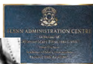
FLYNN ADMINISTRATION CENTRE