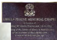
URSULA FRAYNE MEMORIAL CHAPEL