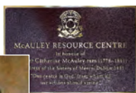
McAULEY RESOURCE CENTRE

Mother Catherine McAuley rsm 1778-1841. Foundress of the Sisters of Mercy, Dublin 1831. "Our centre is God from whom all our actions should spring"